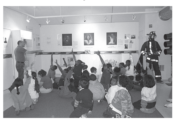
EXHIBIT SCHEDULE & FEES

Appropiate for grades 1st through 8th. (Not recommended for Kindergarten.)